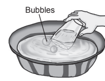
She tilted the glass and slowly pushed it down into a tub of water.